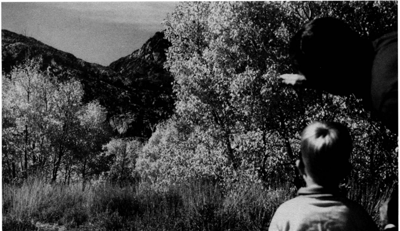
Families are able to spend time together at the Feast of Tabernacles and enjoy the wonders of creation.

The Feast of Tabernacles was celebrated just after the larger fall harvest. Ancient Israel was a farming society, and the successful harvest was