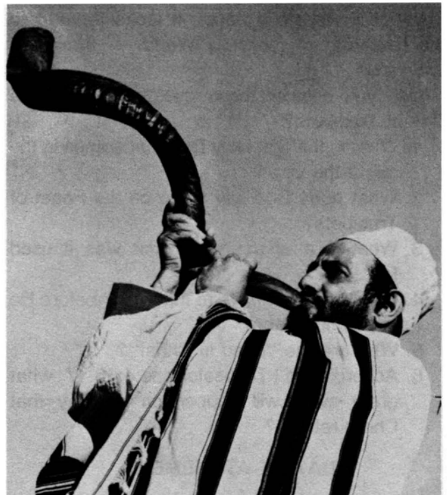
The shofar alerted ancient Israelites to various things such as approaching armies. A mighty trumpet blast will announce Jesus Christ's return.

The Bible says that Christ will return with the sound of a trumpet. Read it in I Thessalonians 4:16. Isn't it a shame that Satan has so deceived the world that Christ's wonderful reign of peace will have to begin with war?