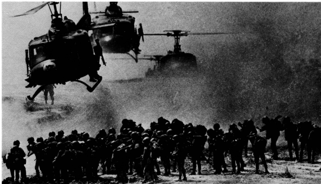
Satan's attitude of rebellion and hatred has caused man to pursue the way of war and death.

Some time after Satan was given power over